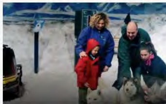
Antarctic Centre Christchurch & South Canterbury