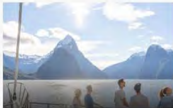
Milford Sound Cruise Te Anau & Fiordland