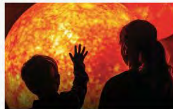
Dark Sky Experience Lake Tekapo & Aoraki Mt Cook