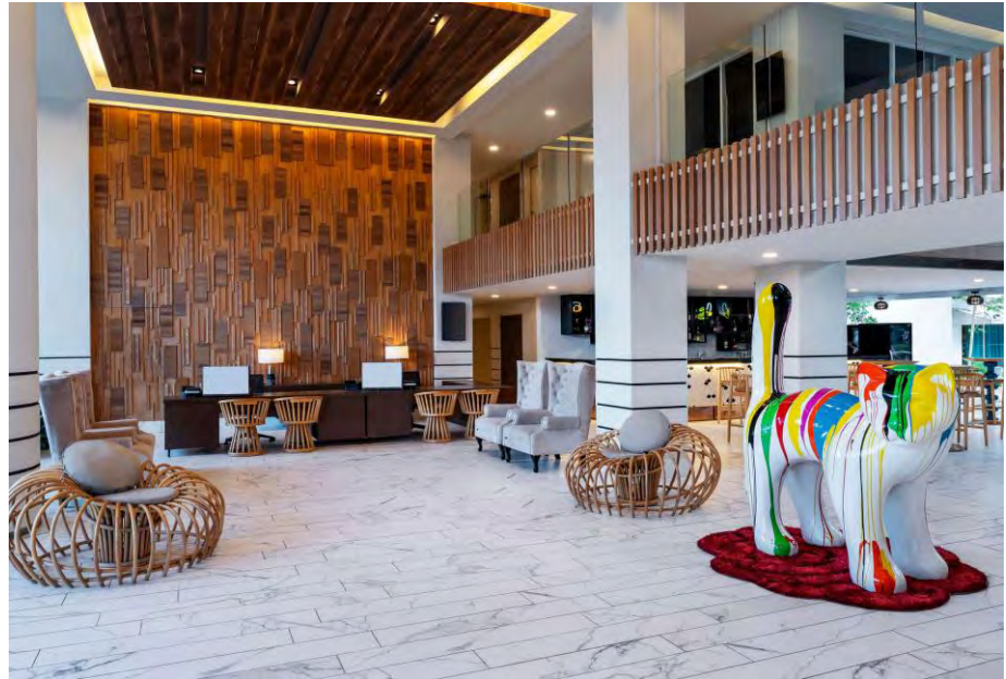
TOURFARE PER PERSON IN MALAYSIAN RINGGIT (MYR)