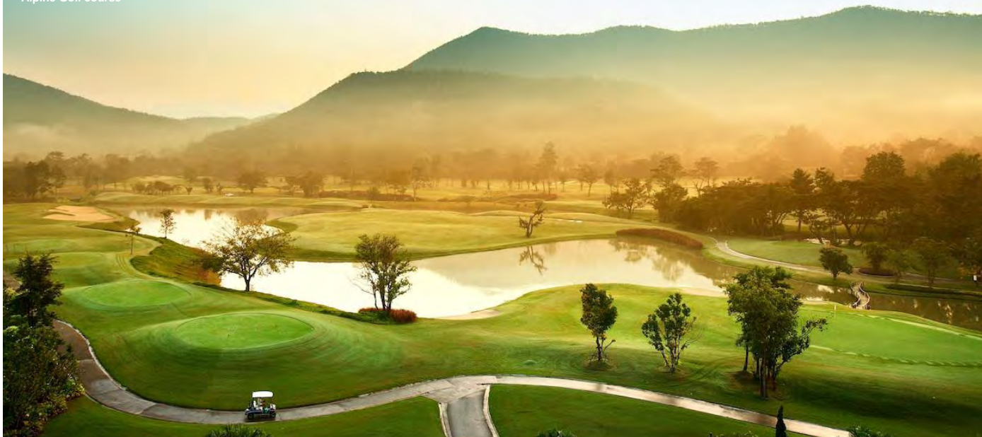
Alpine Golf course

Sunway Travel Sdn. Bhd. (Co.No: 198601009346 (158589-D)) (KPL-0210)