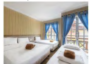
Superior Queen Plus Quad

For enquiries & booking, please contact: