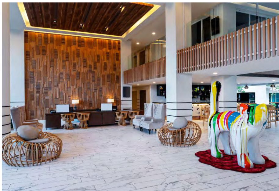
TOURFARE PER PERSON IN MALAYSIAN RINGGIT (MYR)