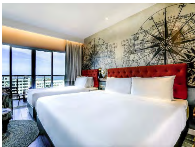
Family Room with 1 double bed and 1 single bed