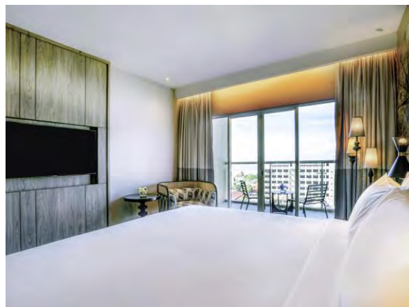
Superior Room, Ocean view