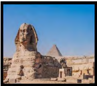
Pyramids of Giza