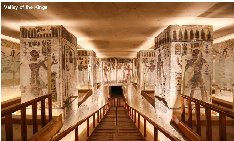
Valley of the Kings