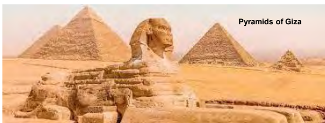
Pyramids of Giza