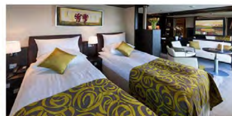
Royal Suite 300.0 sq. ft. Royal Deck (Category S)