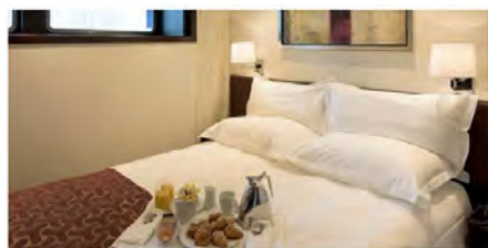
Deluxe Stateroom 172.0 sq. ft. Indigo Deck (Category D, E)