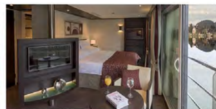
Royal Suite 300.0 sq. ft. Royal Deck (Category S)