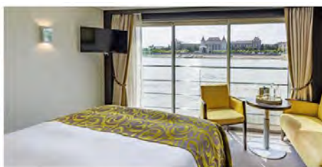
Panorama Suite 200.0 sq. ft. Sapphire, Royal Deck (Category A, B, P)