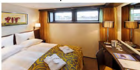
Deluxe Stateroom 172.0 sq. ft. Indigo Deck (Category D, E)