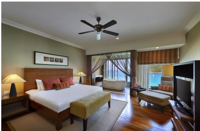
Cliff Premier Suite