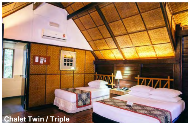
Chalet Twin / Triple