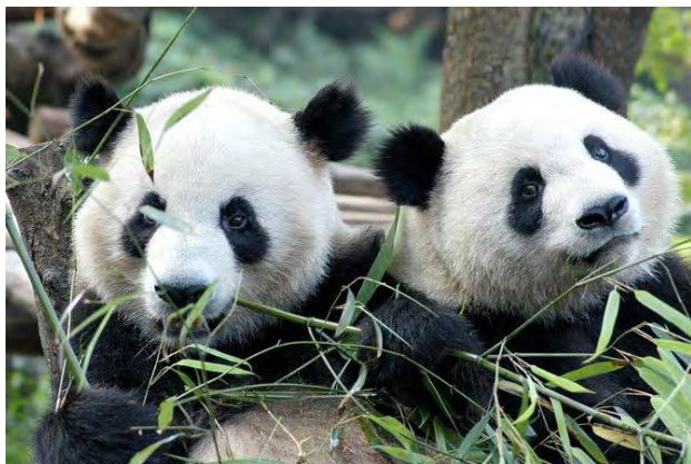
Giant Panda, Chengdu