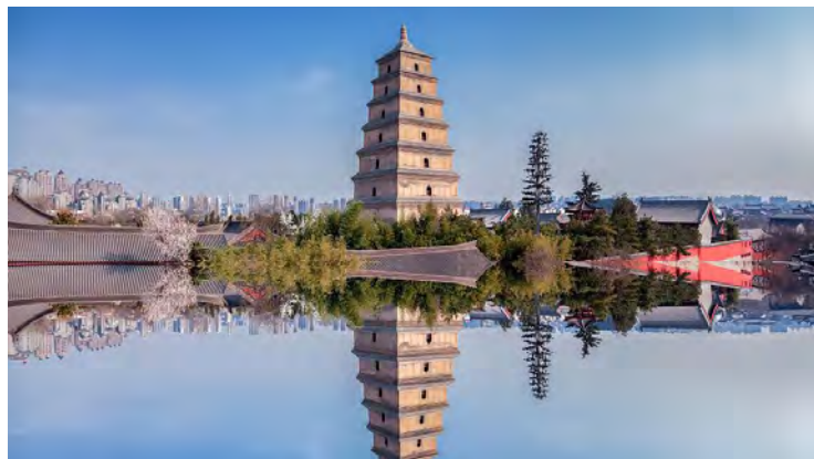
Big Wild Goose Pagoda, Xian China