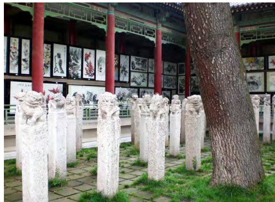
Stele Forest Xian China