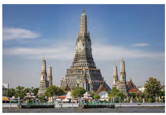
Wat Arun Bangkok

Sunway Travel Sdn. Bhd. (Co.No: 198601009346 (158589-D)) (KPL-0210)