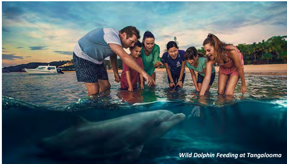
Wild Dolphin Feeding at Tangalooma