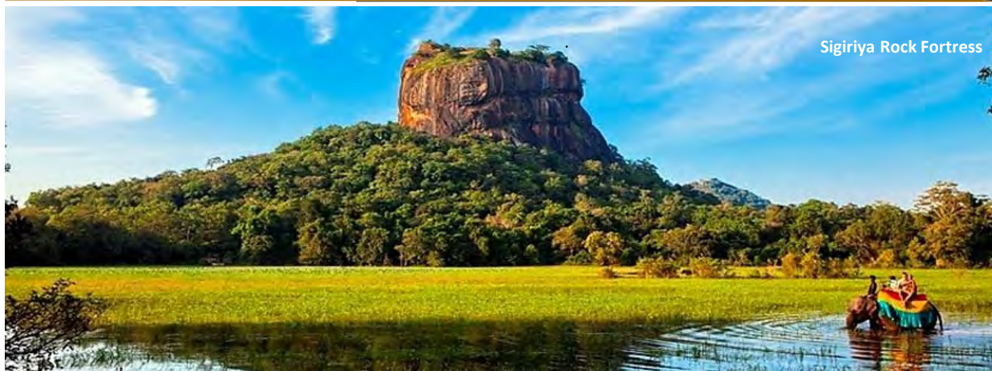
Sigiriya Rock Fortress