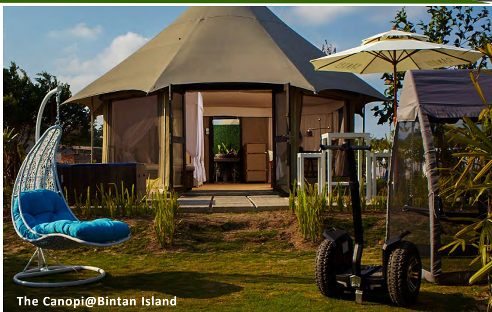
The Canopi@Bintan Island

Tourist visa is not required for Malaysian passport holder.